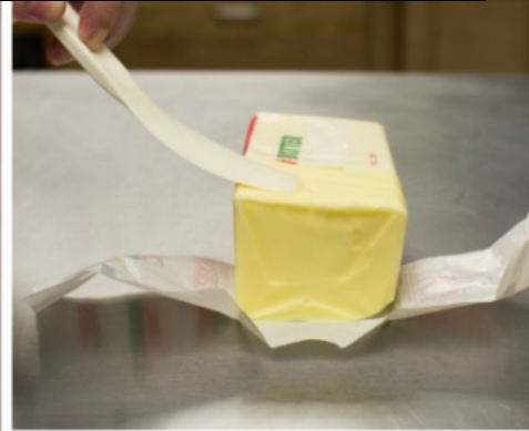
Too cold butter