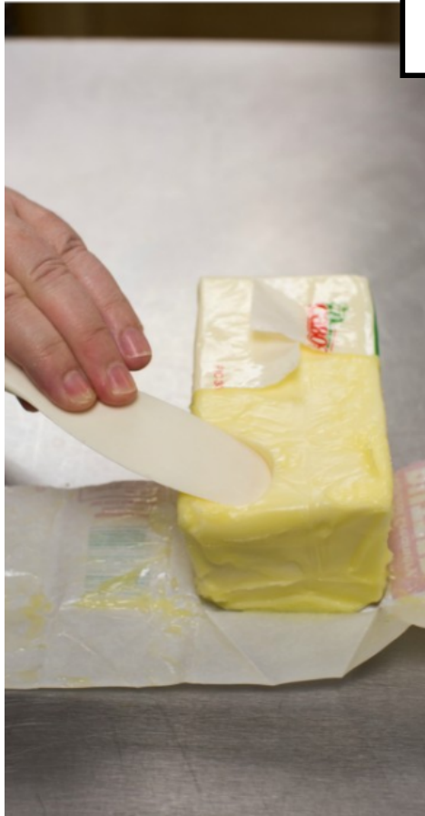
Ideal room temperature butter